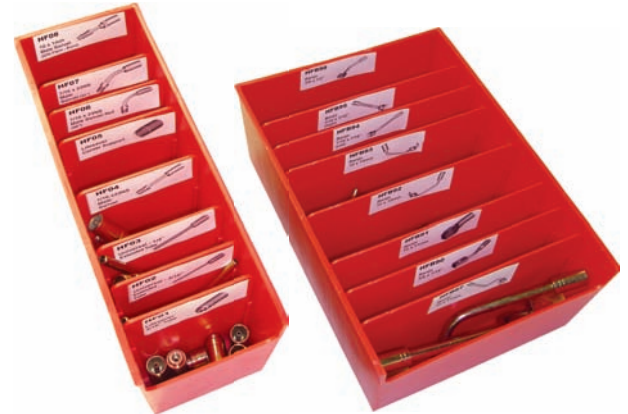
3.5 x 10 Inches