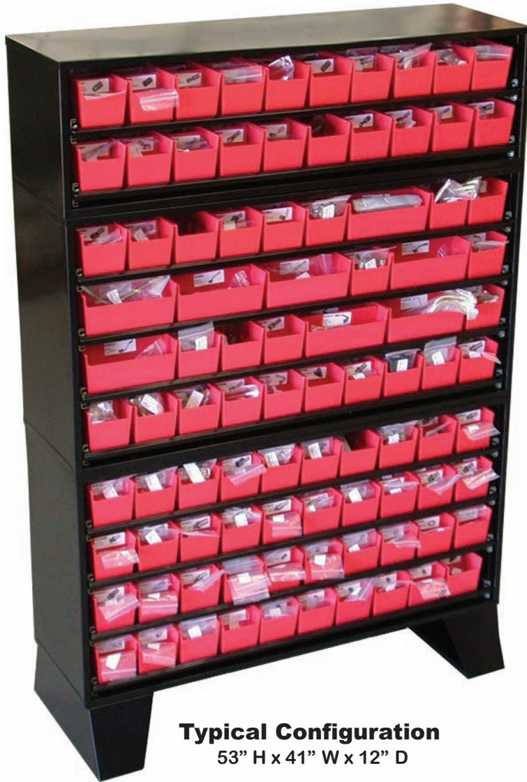
Typical Configuration 53" H x 41" W x 12" D

Bin Boxes can be ordered separately in whatever combination best fits your needs. Three dividers come with each bin box as standard. Each bin box has seven available slots to allow for maximum utilization.